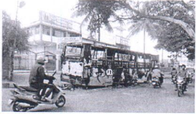
ಪ್ರತಿಭಟನಾಕಾರರ ಅತಿ ಸ್ವಲ್ಪ ಸಂಖ್ಯೆಯಿಂದ ವಾಹನಗಳ ಚಲನೆ