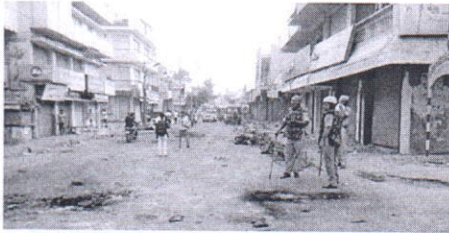
ಬೀದಿಯಲ್ಲಿ ಕೆಲವು ವ್ಯಾಪಾರಿಗಳಿಗೆ ಸ್ವಲ್ಪ ಸಂಖ್ಯೆಯಲ್ಲಿ ಬೀದಿಯಲ್ಲಿ ವ್ಯಾಪಾರ