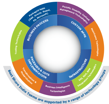
A blend of horizontal and domain capabilities

For more information, contact: sales@mphasis.com