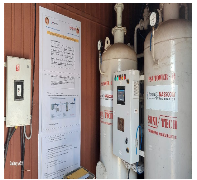
The oxygen generation plant is a 2 PSA Tower/ sodium Zeolite Molecular Sieve with 10 year life span & a 6 stage filtration process.

The findings have been analysed and presented using the DAC/OECD standards of Relevance, Effectiveness, Efficiency, Sustainability and Impact.