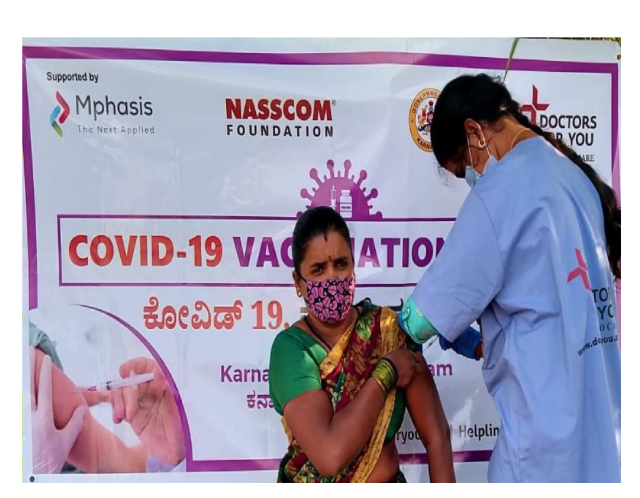
Vaccination drive at Puttenahalli, ward 187

BBMP ward 187 Puttenahalli certified that 6049 vaccinations were complete; BBMP ward 190 Mangammanapalya certified that 5603 vaccinations were complete at Bommanahalli Zone and ward no 195, Konanakunte certified 6671 vaccinations that were completed at Bengaluru South.