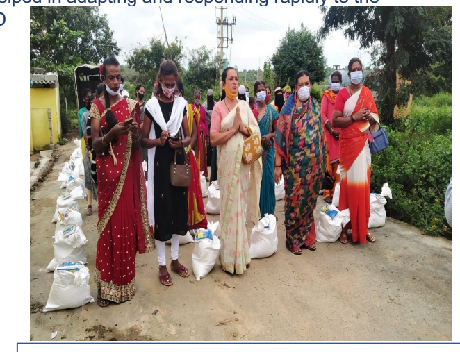
Distribution @ Iragampalli village @Chikkabalapur.

Immediate and timely distribution: The team managed to get Big Basket to quickly prepare the orders. Big basket delivered the kits at Gandhinagar. AVORD in consultation with local authorities identified the areas and people who were most affected by the pandemic, especially the second wave. On an average each village had an approx. of 40 families to whom the kits were distributed. The food kits were widely distributed across 12 villages in Kolar and Chikkabalapur District.